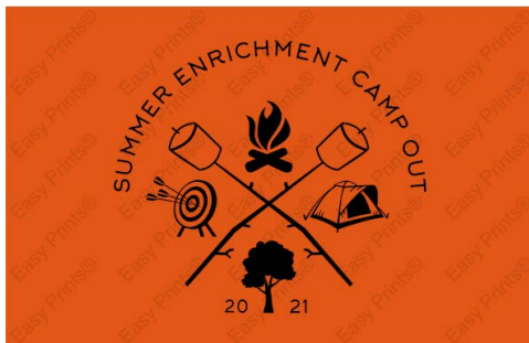
Discovery Chest Options

Please remember that S-MORE learning is great for our students in the summer!!! Working together we can prevent the summer slide.